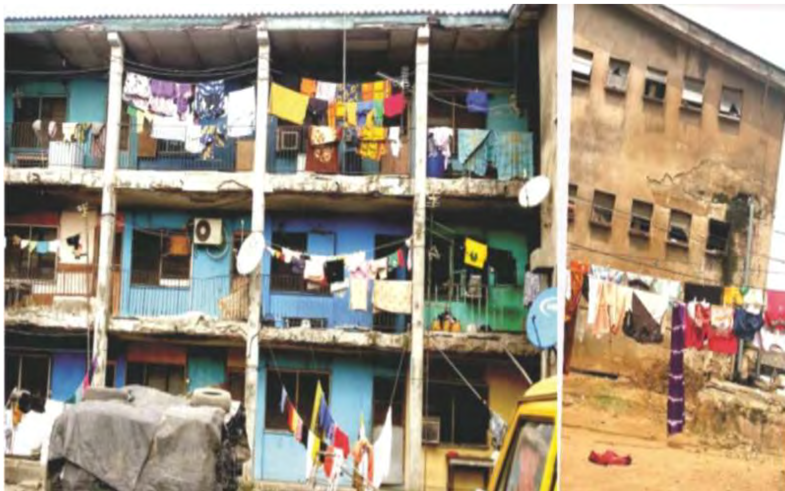
A police barracks

One policewoman deployed in the Department of State Security, CBD road, Shangisha (names withheld) who lives inside Falomo Barracks laments how bad her apartment is.