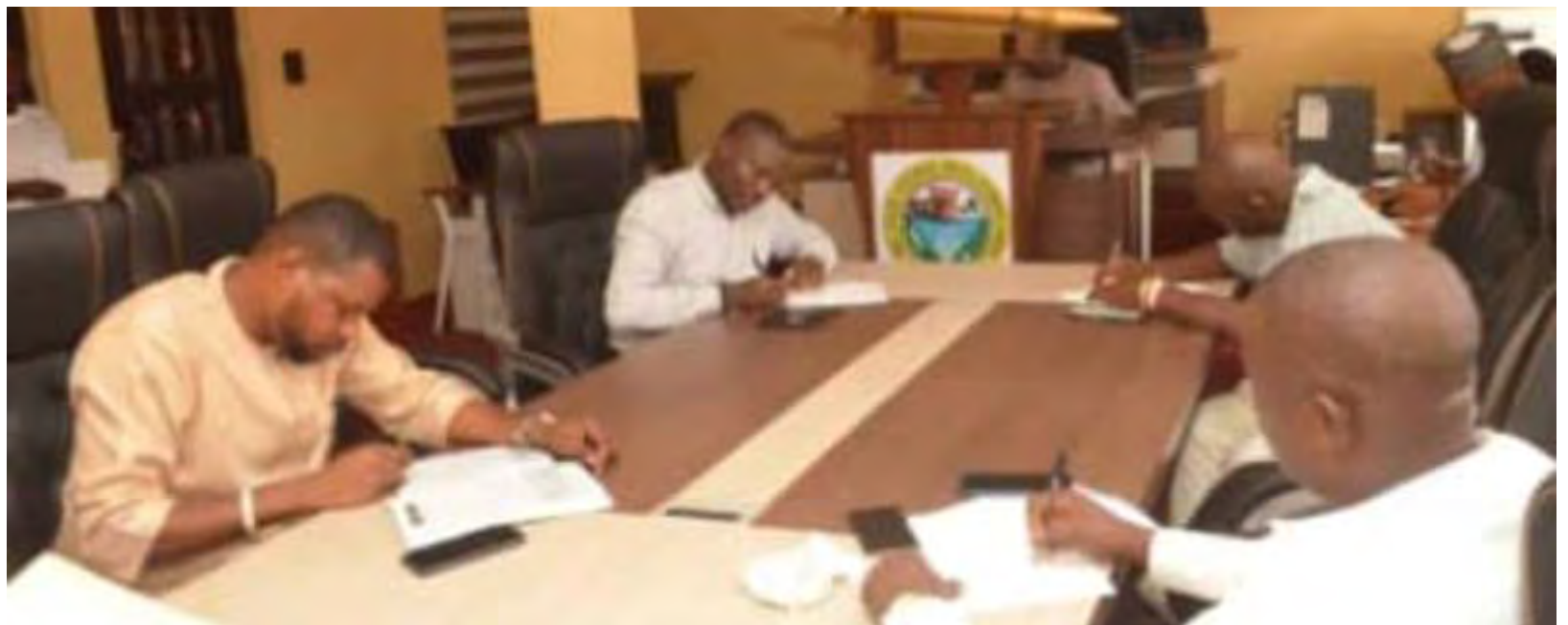
Iba legislative arm in dialogue with contractor