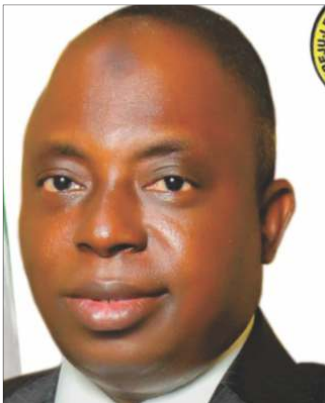
Hon. Olowa Abdulahi

"We are seeking the LG's intervention to help with