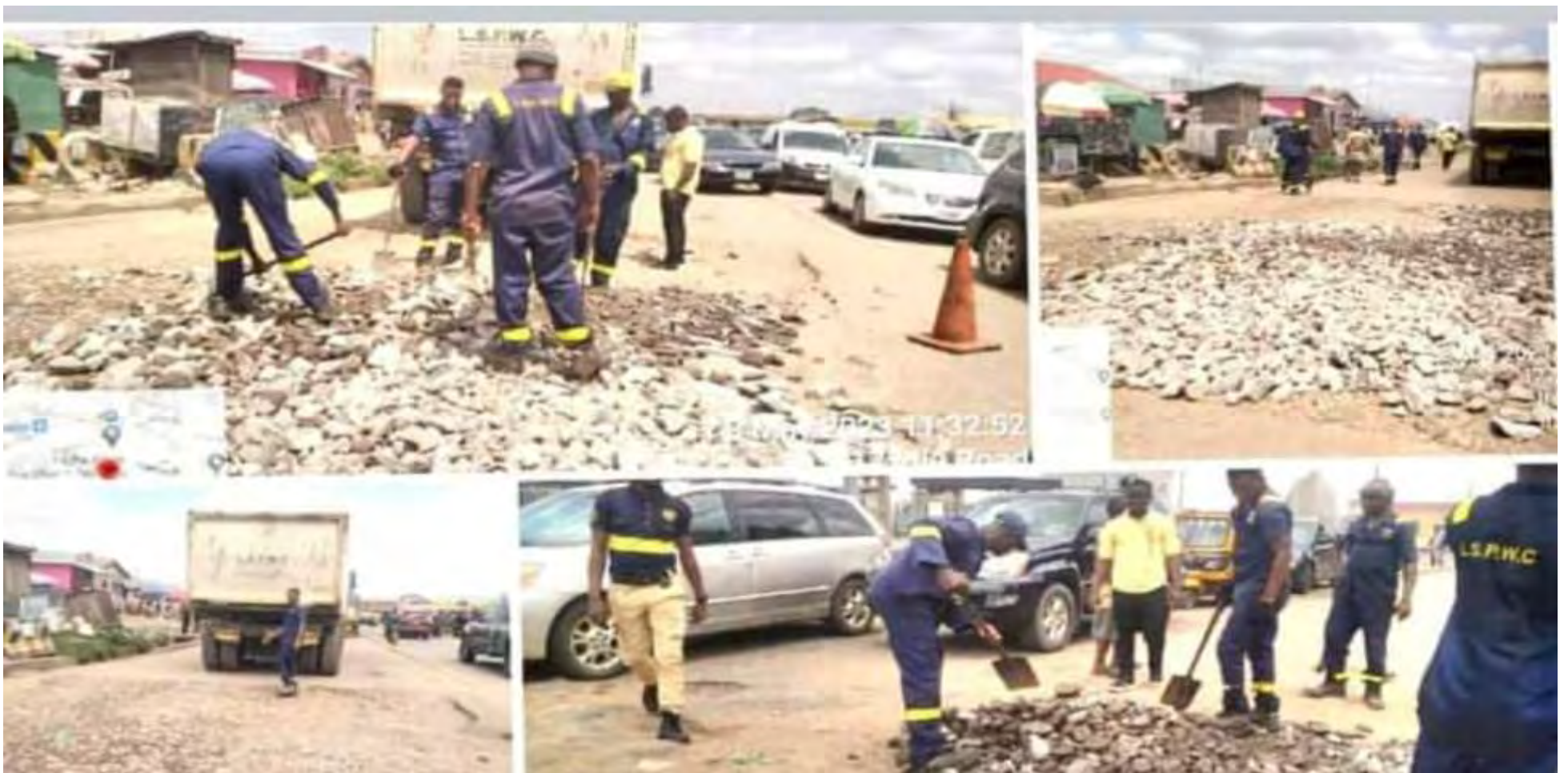
Road rehabilitation in Fagba axis

project would be beneficial to the residents and commuters in the area as it will improve the condition of the road and reduce traffic congestion.