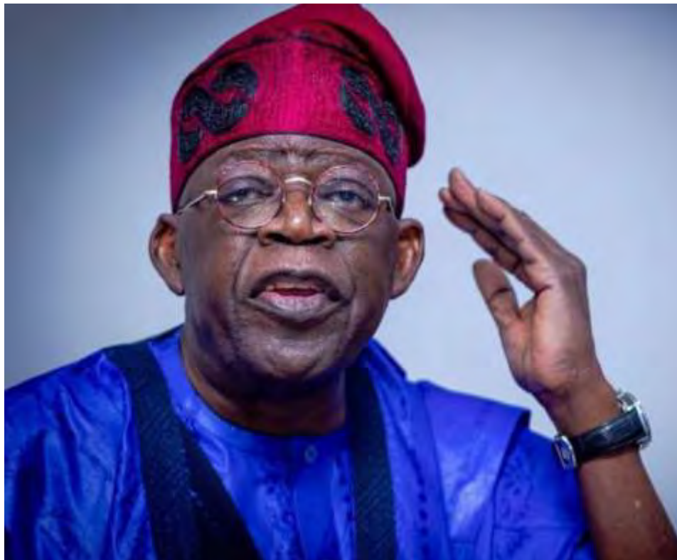
Ashiwaju Bola Ahmed Tinubu