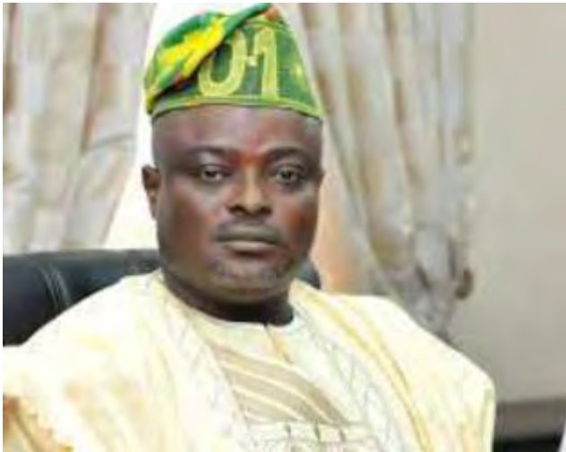
Rt. Hon. Mudashiru Obasa

"It's our policy to have functional primary health centres in our various communities to provide and enhance quality healthcare for our people in line with our administration's core mandate while collaborating with the Lagos State Government and development partners," he said.