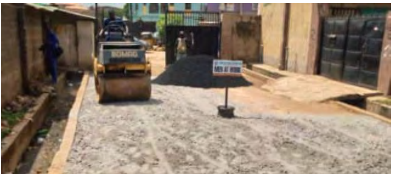
Afolabi street rehabilitation