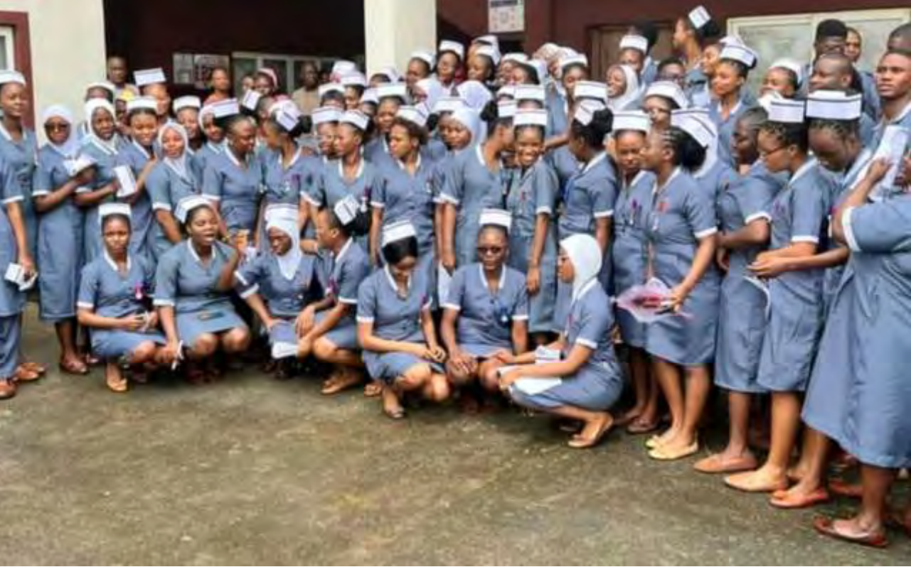
Graduands in group photographs