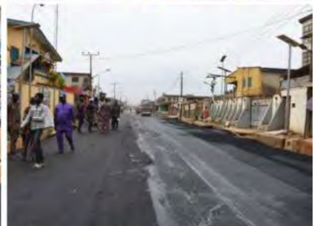
Ifoshi Road, Ejigbo