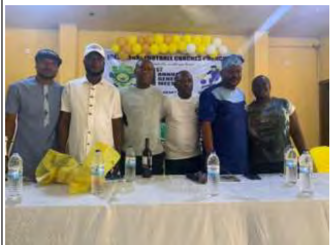
Ibeju lekki coaches