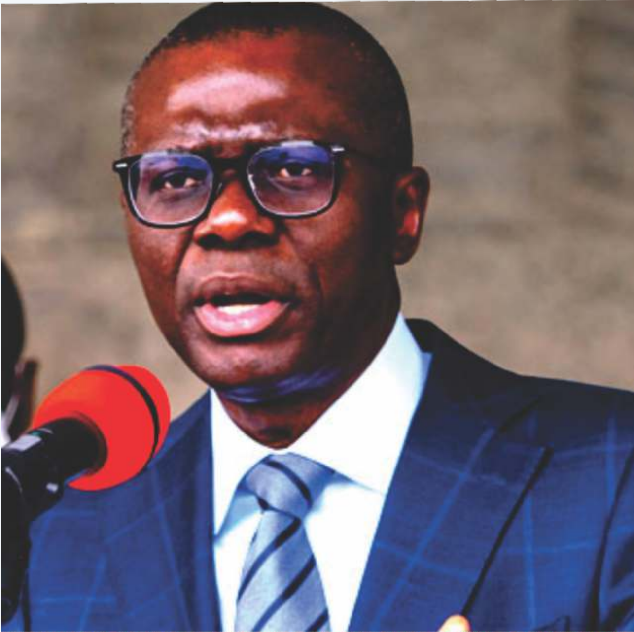
Gov. Babajide Sanwo-Olu